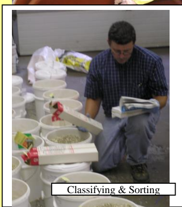
Classifying & Sorting