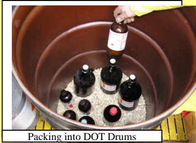
Packing into DOT Drums