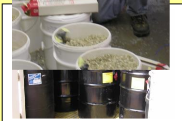
Packed & Ready for Transport