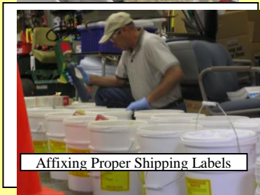
Affixing Proper Shipping Labels